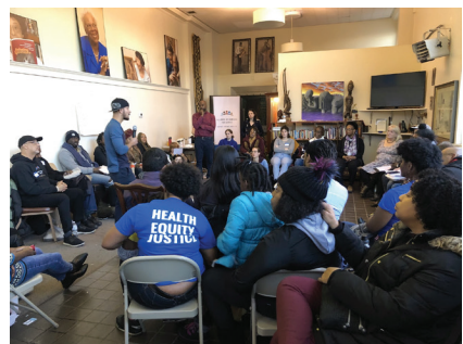
Albany Regional Conference