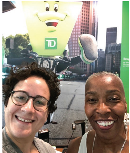
Bank account opening with 501C3 status.

We accomplished a major organizational growth goal this year by integrating Powerbase, a database for organizers, into our workflow. Through rigorous training and customization both by our staff members and by the Powerbase team, by the end of 2019 we accomplished our goal of tracking the majority of our work, including meetings, events, support circles, donations, grant management, and newsletter publishing, within this database. This enables us to have a clear picture of what we have accomplished and what our goals are for the future, and provides us with accurate and precise metrics for internal evaluation and reporting to our funders.