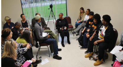
Buffalo Regional Conference

Throughout 2018 and 2019, we co-hosted regional conferences with ally organizations in major regions of New York State. These regional conferences explored the impact of mass