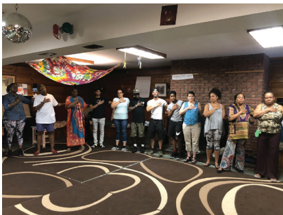
Group family retreat