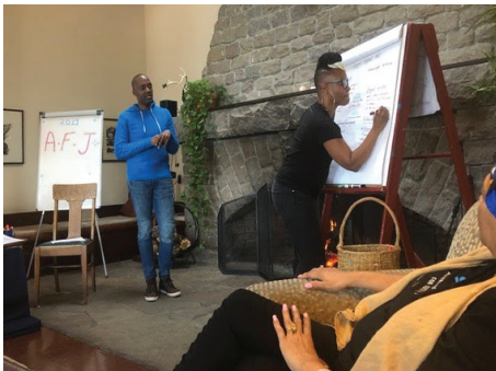
Staff brainstorm at Blue Mountain Center.

On October 31-November 3, Alliance of Families for Justice held our first ever staff retreat at the Blue Mountain Center. Over the course of the four days, the staff engaged in intensive